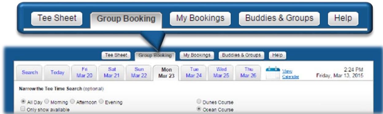
Example 1 - The Group Booking button.

The difference being that when the booking detail window opens (where your playing partners' names are entered), you will see an option that says Number of lottery groups from which you will be able to select up to four, which you can see in Example 2 .